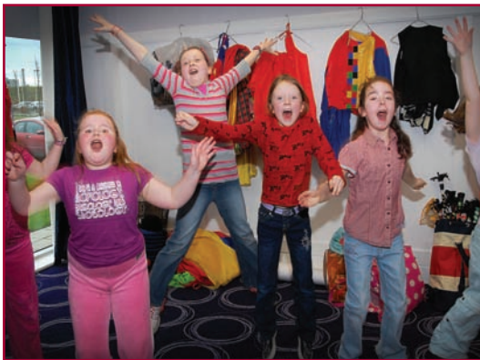
Kidlink Girl Power