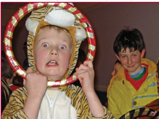
The Celtic Tiger