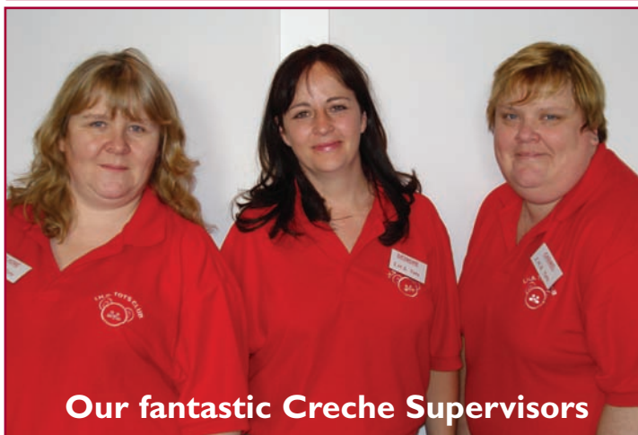
Our fantastic Creche Supervisors