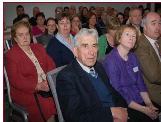
I.H.S. members at AGM 2008