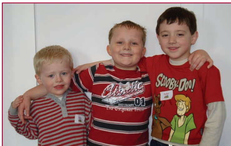
Young members at the AGM