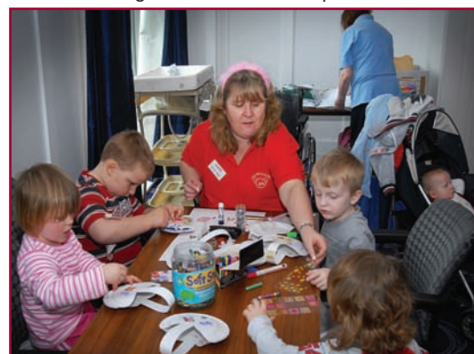
That piece goes there...