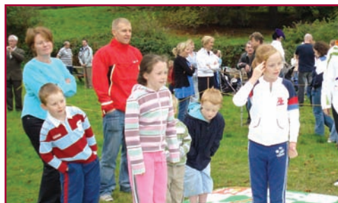
Sports Day at last years members weekend

Due to the ongoing and increasing success of this weekend for the past 2 years, we are pleased to announce that this excellent weekend for all members will take place again this year in the County Arms Hotel. We are at the moment in the process of planning an exciting programme with something of interest for everyone, including a programme for children over 11 years, at the Birr Outdoor Education Centre which is beside the hotel.