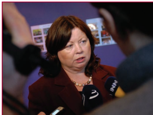
Mary Harney, Minister for Health & Children at our AGM