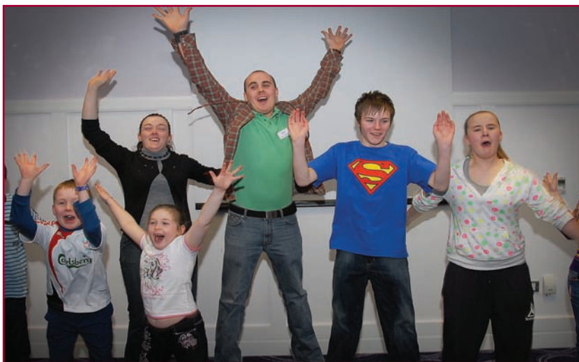
What a weekend!