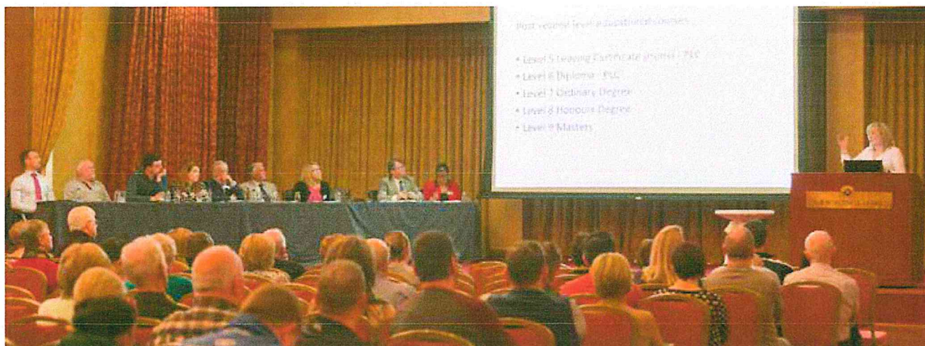
The Annual General Meeting on Saturday morning

Throughout the weekend I spent the majority of my time in the Cranaghan Suite at the various talks and sessions. I'm not