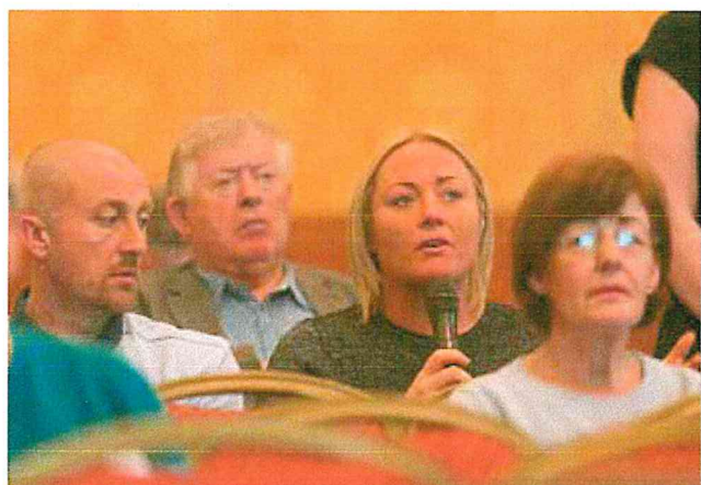
Members asking questions during the Annual General Meeting.

going to lie, I'm a complete nerd, so having the opportunity to sit in on all the talks was fantastic. I found the history session on Friday evening extremely insightful and a really nice way to start the weekend. I enjoyed getting to go to see two of the children's groups during the weekend. It was evident how much the children enjoy themselves, how much they get from taking part and the friendships they have formed. I firmly believe these friendships will be the biggest asset to them in dealing with their haemophilia or bleeding disorder, or their sibling's haemophilia or bleeding disorder. I was completely blown away by all the developments in haemophilia care. My