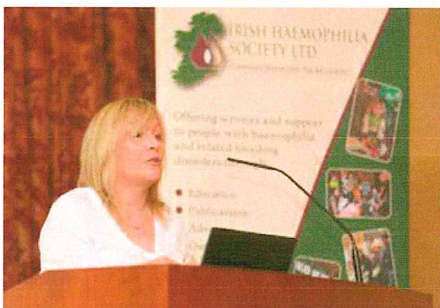
The Chairperson addressing the membership on Saturday morning

going to lie, I'm a complete nerd, so having the opportunity to sit in on all the talks was fantastic. I found the history session on Friday evening extremely insightful and a really nice way to start the weekend. I enjoyed getting to go to see two of the children's groups during the weekend. It was evident how much the children enjoy themselves, how much they get from taking part and the friendships they have formed. I firmly believe these friendships will be the biggest asset to them in dealing with their haemophilia or bleeding disorder, or their sibling's haemophilia or bleeding disorder. I was completely blown away by all the developments in haemophilia care. My