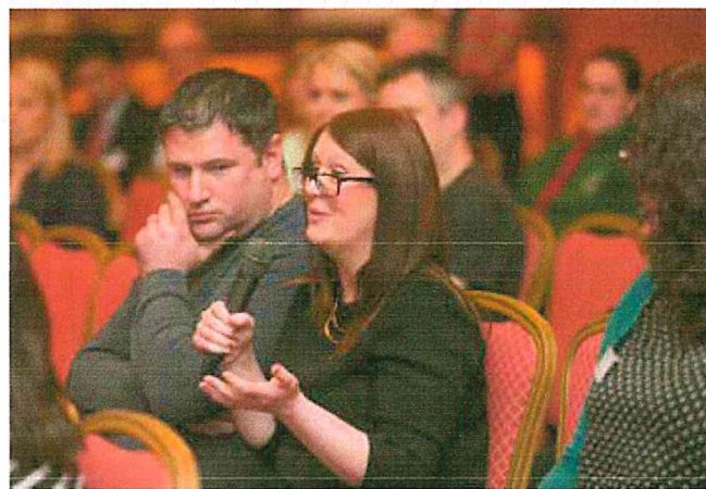
Members discussing issues at the Open Forum on Saturday afternoon

When I started working at the Irish Haemophilia Society, the office was in a state of AGM fever. It was five and a half weeks away and there was so much to do.