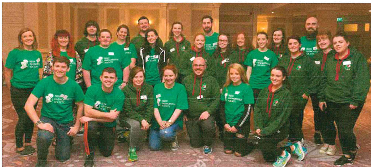
Our fantastic volunteers.