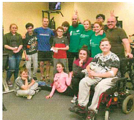
The Youth Group at the gym