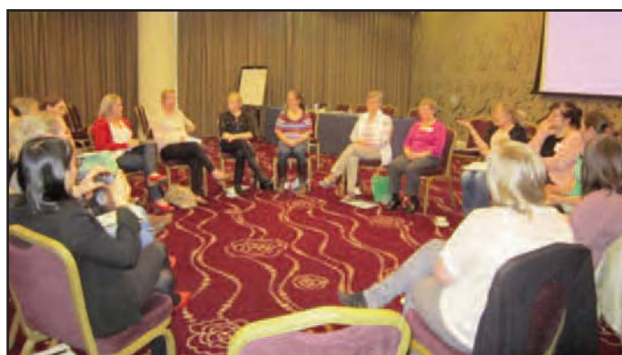
The highlight for many who attended the Parents Conference was the Mothers and Fathers Workshops.